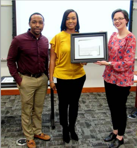
Best Serial in Print – Mississippi Public Broadcasting for Fine Tuning

The Mississippi Library Commission recently presented the inaugural Summit Awards to recognize excellence in state government publications. The three award categories were Best Serial in Print, Best Serial in Digital, and Best Monograph. Congratulations to the winners!