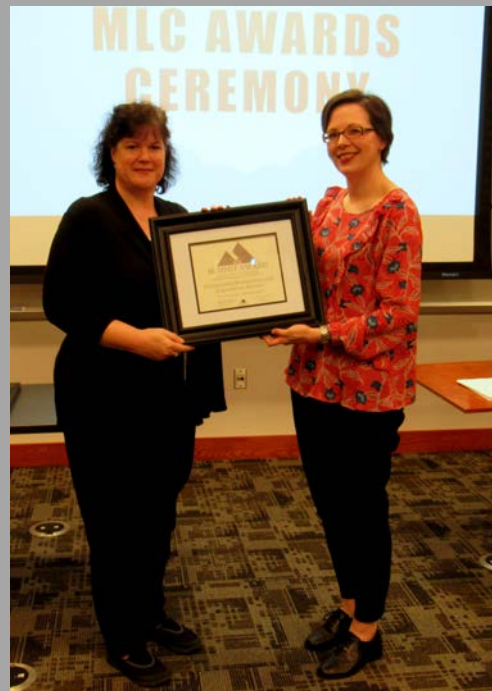
Best Digital Serial Mississippi Department of Archives and History for Mississippi History Now