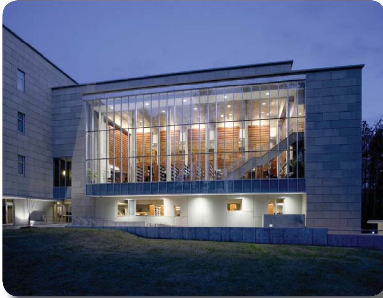
NIGHT CURTAIN WALL/rear view of MLC