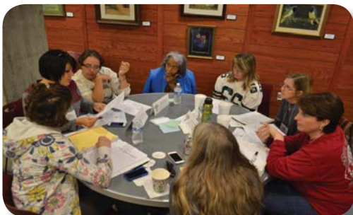
MLLI participants discuss solutions to a problem during an exercise in conflict solutions.

A Laura Bush 21st Century Librarian Program Grant from the Institute of Museum and Library Services funded the Mississippi Library Leadership Institute (MLLI) , designed to grow the next generation of library leaders and directors in the state of Mississippi. The Institute features training, as well as project and mentoring components designed to create a transformational experience for participants. The Institute emphasizes experiences that build strong relationships with peers and involve a very high level of intensity and risk-taking. Participation for the 28 individuals is through a competitive application process.